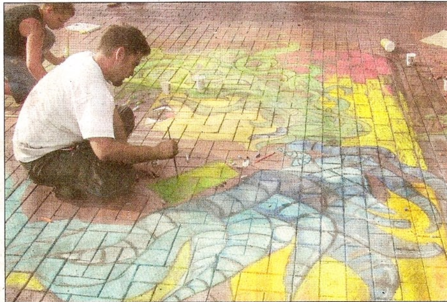
FROM KANSAS CITY CHALK AND WALK

The Kansas City Chalk and Walk Festival will add some color to Crown Center Square on Saturday and Sunday. The event includes music and kids activities.